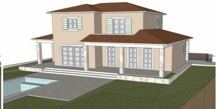
JUGOISTOČNO | SJEVEROISTOČNO PROČELJE

Sveta Nedelja, located in central Istria, is known for its peaceful rural setting and enchanting landscape. This municipality encompasses numerous picturesque villages, surrounded by vineyards, olive groves and untouched nature. Sveta Nedelja offers an authentic experience of Istria, with a rich history, traditional architecture and hospitable people, making it an ideal place to relax and explore the Istrian way of life.