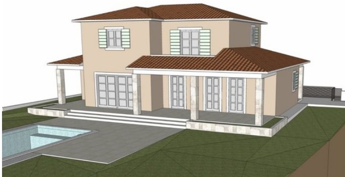
JUGOISTOČNO | SJEVEROISTOČNO PROČELJE