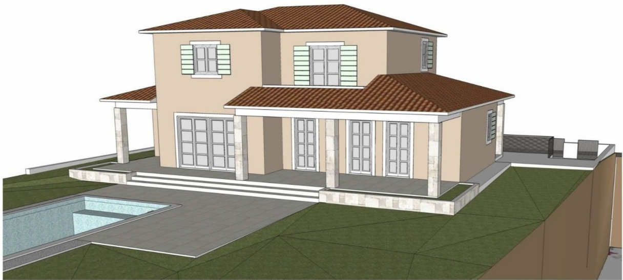
JUGOISTOČNO | SJEVEROISTOČNO PROČELJE